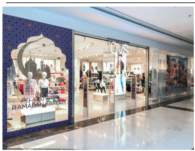
New store in Doha, Qatar