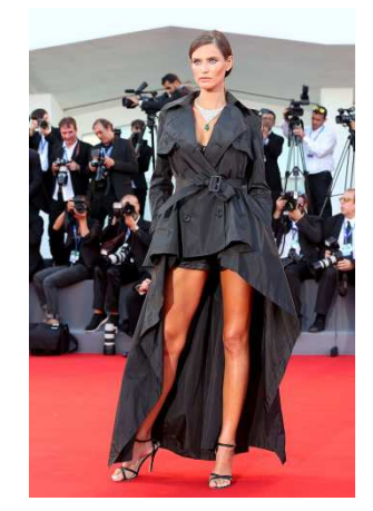
Bianca Balti in Jean-Paul Gaultier for OVS Venice International Film Festival 2016

Operating cash flow for the half-year (negative \epsilon_{24.1} million) is representative of the normal seasonality of the business, accentuated this year by an acceleration of the opening of affiliated stores, both in Italy and abroad, which resulted in an increase in trade receivables. The increase in stock was largely in line with the growth in sales, while payables decreased, mainly reflecting (i) the settlement of balances relating to capex for the LED project carried out in previous periods, and (ii) a partial change in the supplier mix due to the relocation of part of purchasing activities to lower-cost countries and a change in the payment conditions of some suppliers granting better purchasing conditions. The increase in net working capital is under control, in line with the activities implemented by management.