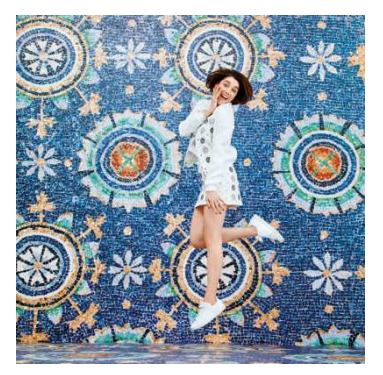
Arts of Italy, the new OVS capsule collection