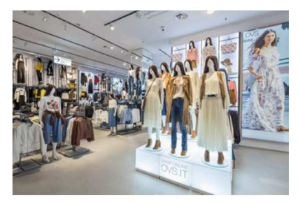
The Flagship Store in Turin